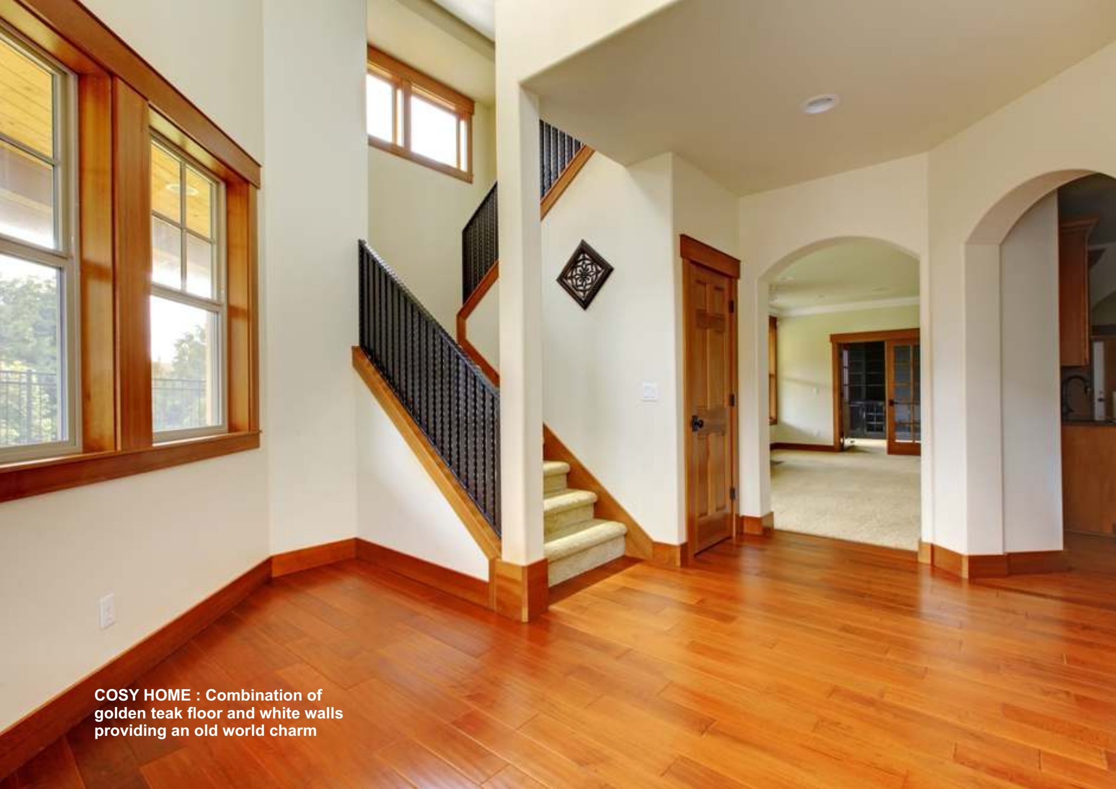
COSY HOME : Combination of golden teak floor and white walls providing an old world charm