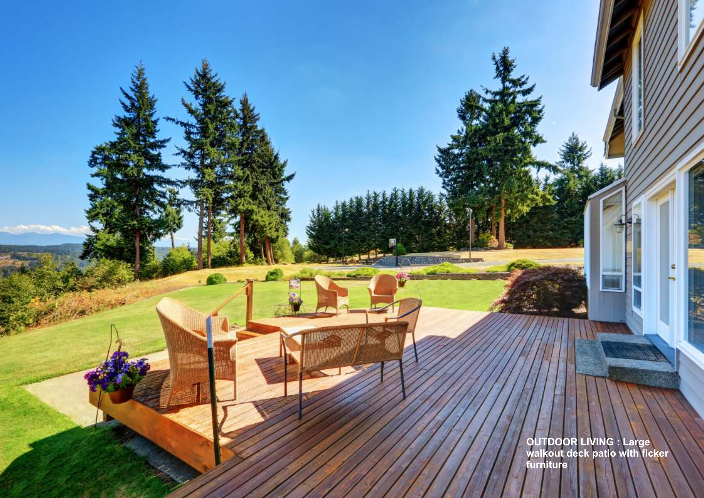
OUTDOOR LIVING : Large walkout deck patio with ficker furniture