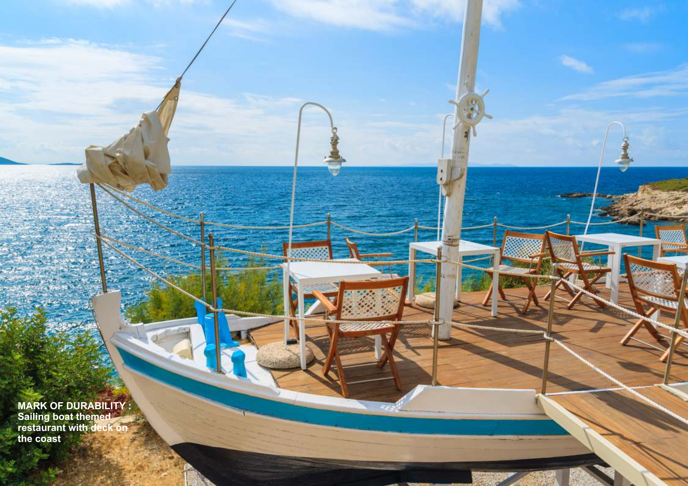
MARK OF DURABILITY : Sailing boat themed restaurant with deck on the coast