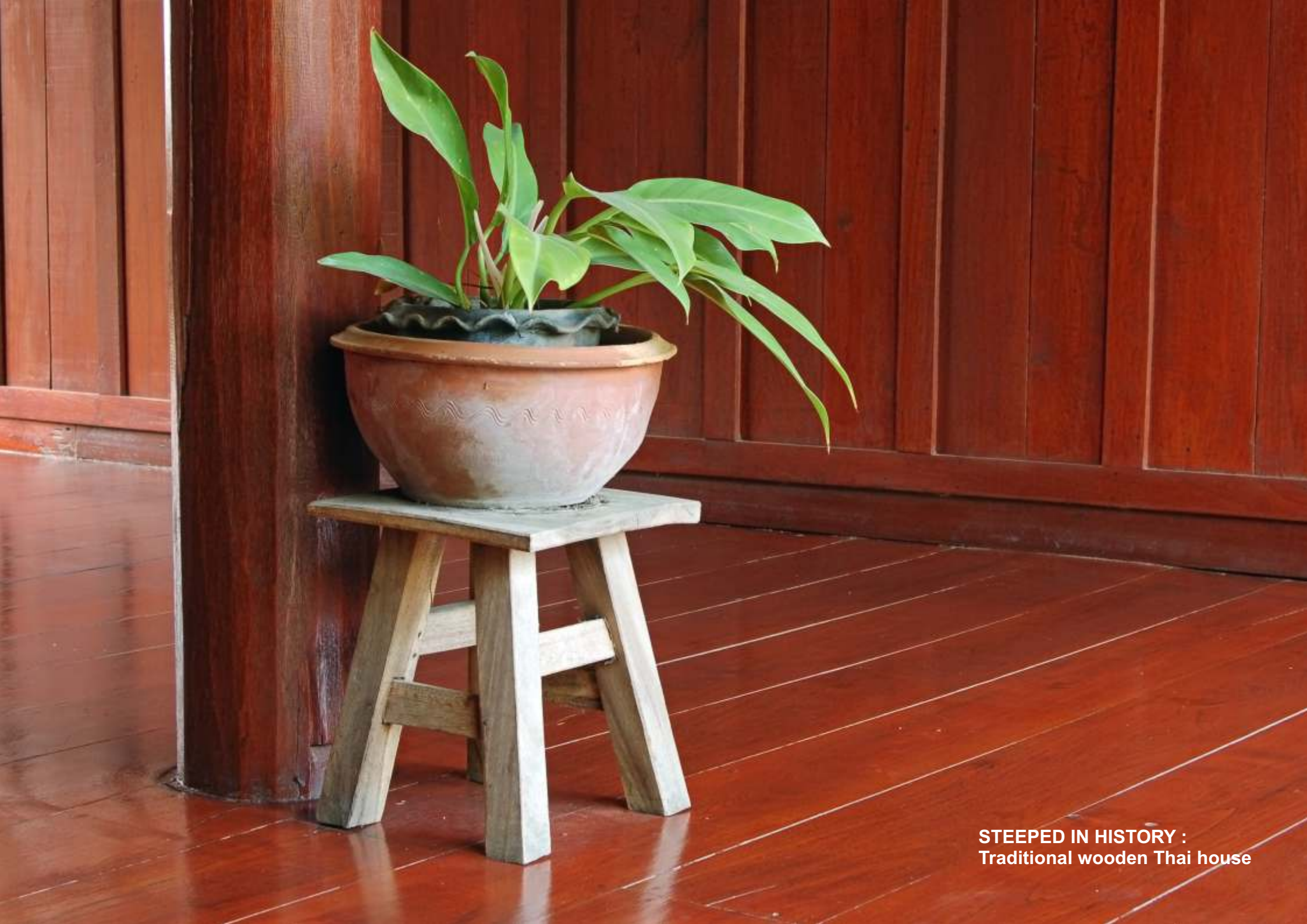
STEEPED IN HISTORY : Traditional wooden Thai house